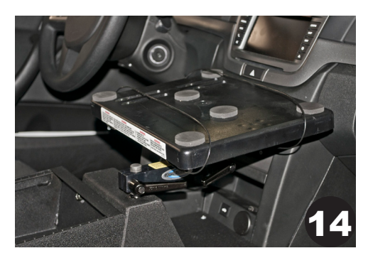
Install Cable-Dock<sup>™</sup> onto straight arm.