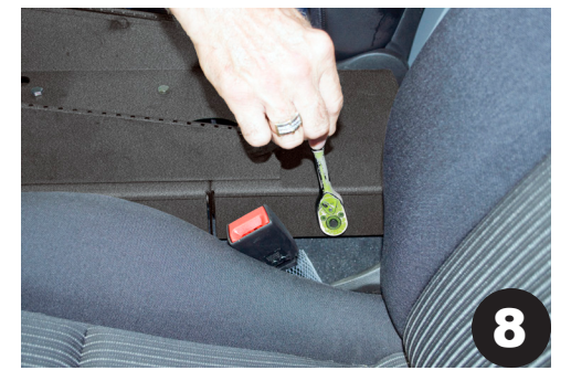
Attach rear section using (2) 1/2" button head flange bolts through rear of floor mounting plate into rear mounting brackets. Repeat for other side.