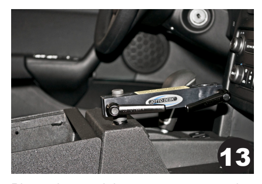
Place the straight arm onto mounting post where the ratchet handles and Jotto Desk logo is facing the passenger's seat.