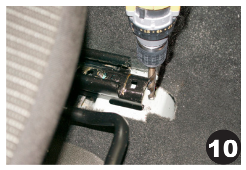
Where reinforcement bracket hangs down, mark location for AVK fastener installation. Then rotate bracket away. Center punch and pre-drill 1/2" hole at marked location.