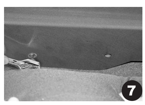
Attach front section using (2) 1/2" button head flange bolts through floor mounting plate into side mounting bracket. Repeat for other side.