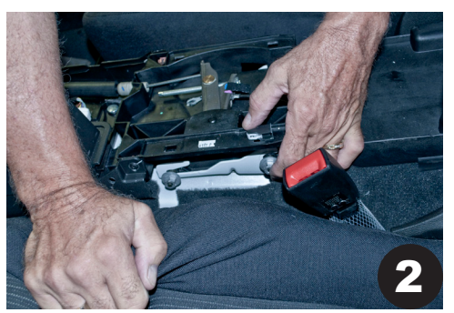
Remove 13mm nuts from the side of the transmission hump between seats and console. Two per side.