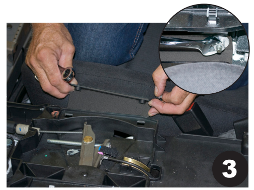
Install mounting brackets using provided 8mm hex nuts from previous step. Making sure to use the correct bracket on each side. Each should be marked P/S or D/S.