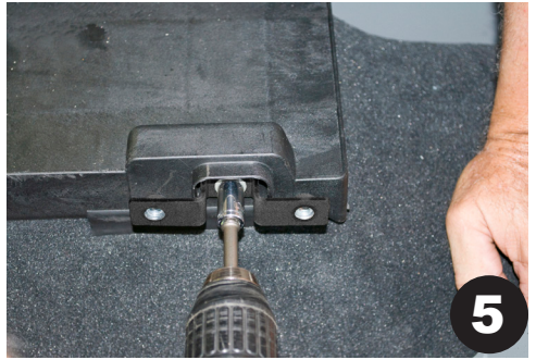
Install rear mounting brackets using the OEM 10mm bolts from previous step.