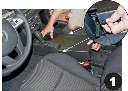
Remove OEM center console cover by removing side clips (see photo for location), and then pull up on plastic to release snaps.