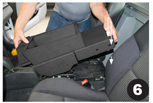
Install Caprice 9C1 MDC Console onto OEM center console, making sure that our brackets go inside of console/ floorplate.